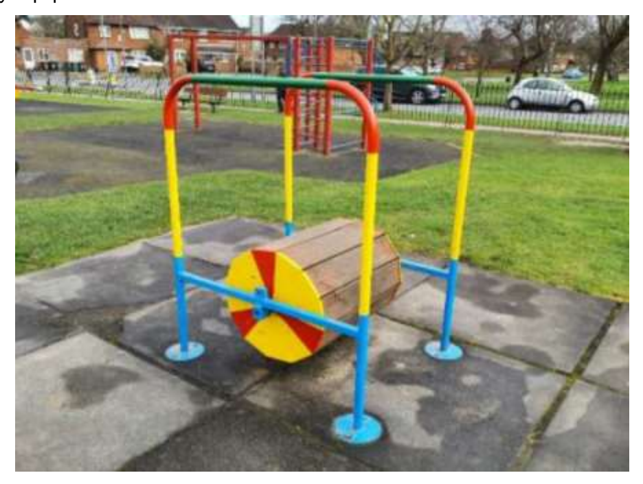
Proposed roundabout with accessible path from Telford Road entrance.